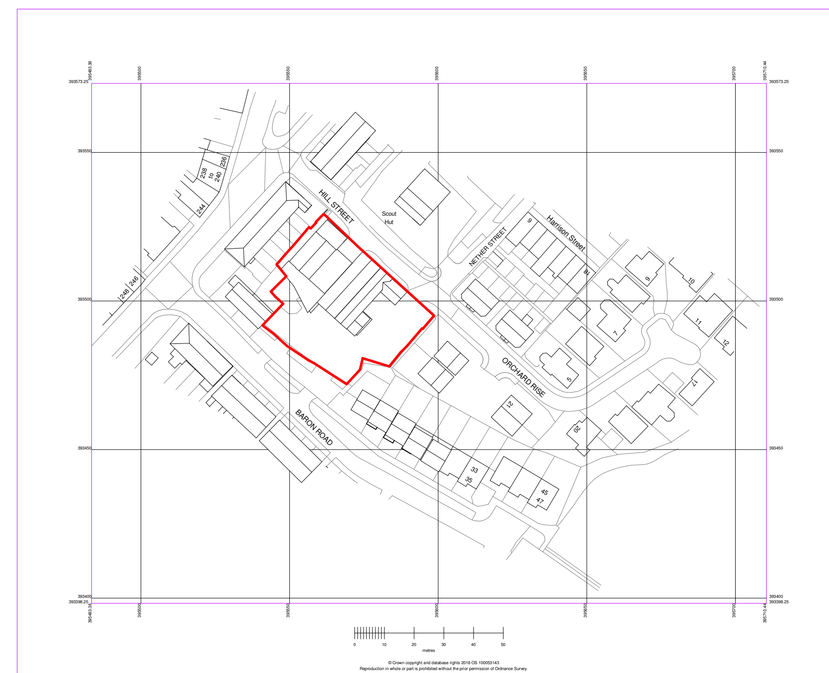
2 Location Plan 1 : 1250