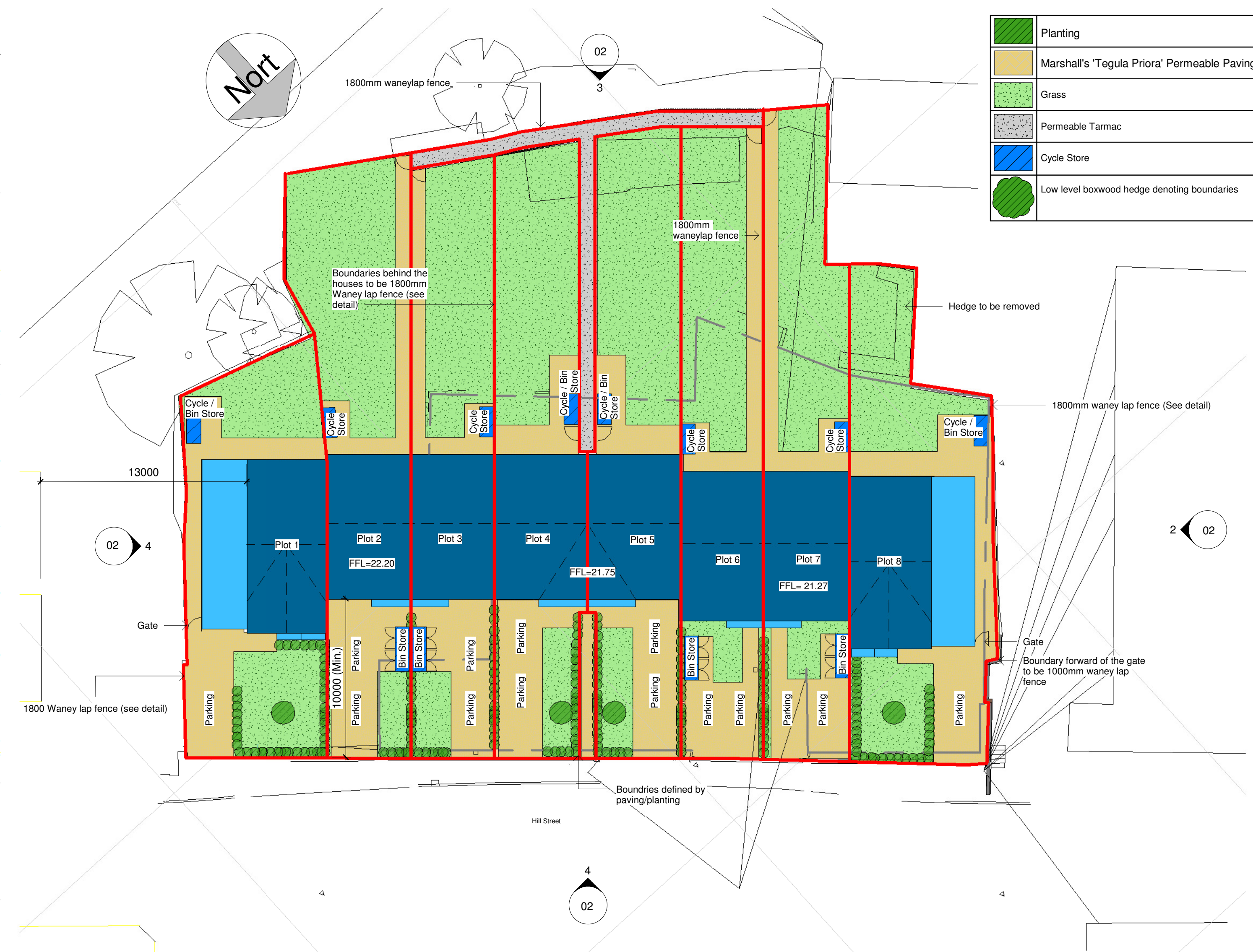
3 Site Proposed 1 : 200